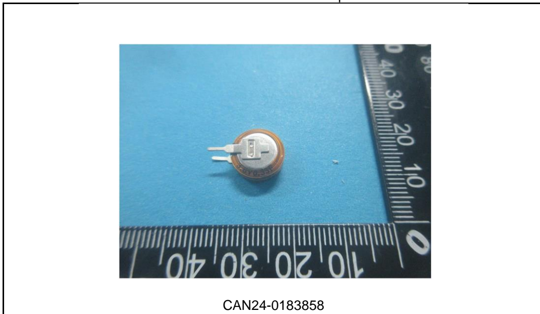
Photo of Submitted Sample

SGS authenticate the photo on original report only